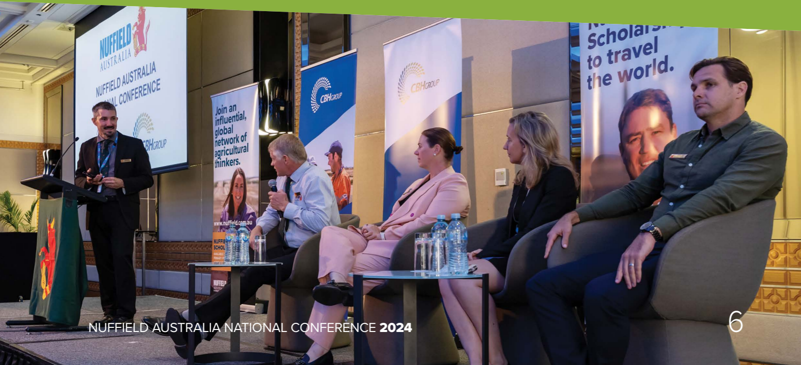
NUFFIELD AUSTRALIA NATIONAL CONFERENCE 2024

Both conference days will feature one main conference room, enabling all delegates to see all presenting scholars and speakers to maximise learnings.